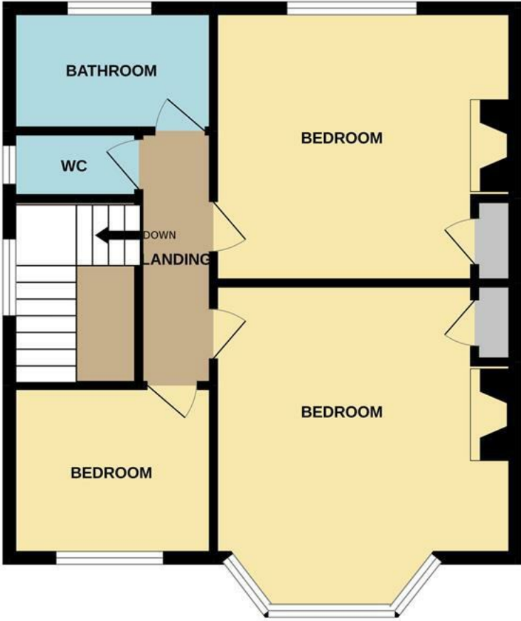
1ST FLOOR 522 sq.ft. (48.5 sq.m.) approx.