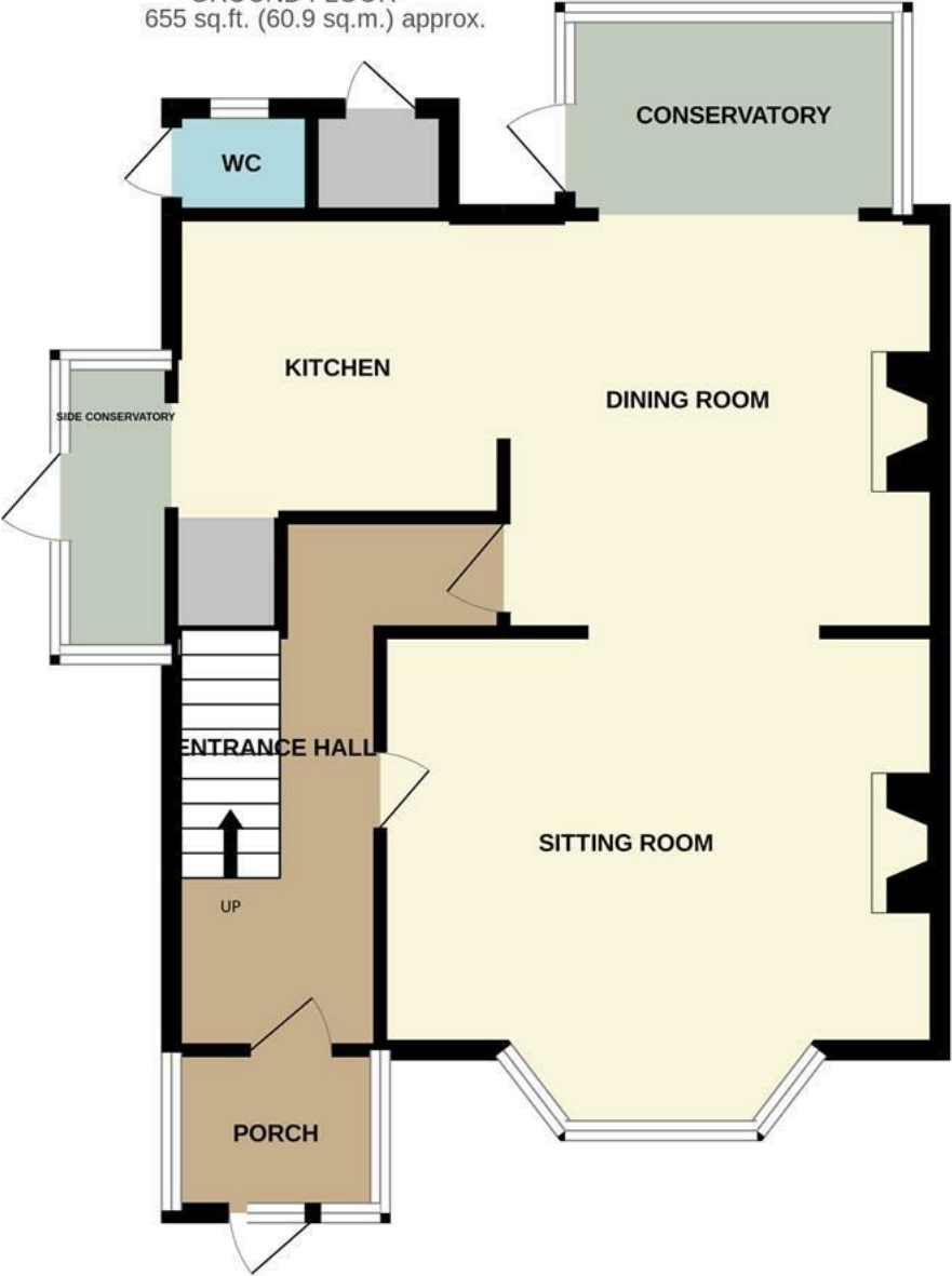
GROUND FLOOR 655 sq.ft. (60.9 sq.m.) approx.